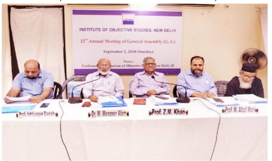
A view of the G.C. meeting

The meeting got concluded at 2:55 p.m. with dua .