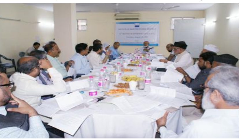
A view of the Governing Council (G.C.) meeting

He then reported with pain that violent incidents over the last three years after the BJP's government in centre, have taken a huge toll on Muslims, Dalits and marginalised & weaker sections of Indian society. But Muslims have mostly borne the brunt of hate crimes, such as lynching, threats, and attacks on places of worship. Extremist right-wing groups including vigilante groups, such as cow protection squads enforcing violent moral policing have created a climate of impunity, which has left Muslims feeling increasingly insecure. He further informed that syllabus and contents of the text books in Social Sciences for schools as well as in