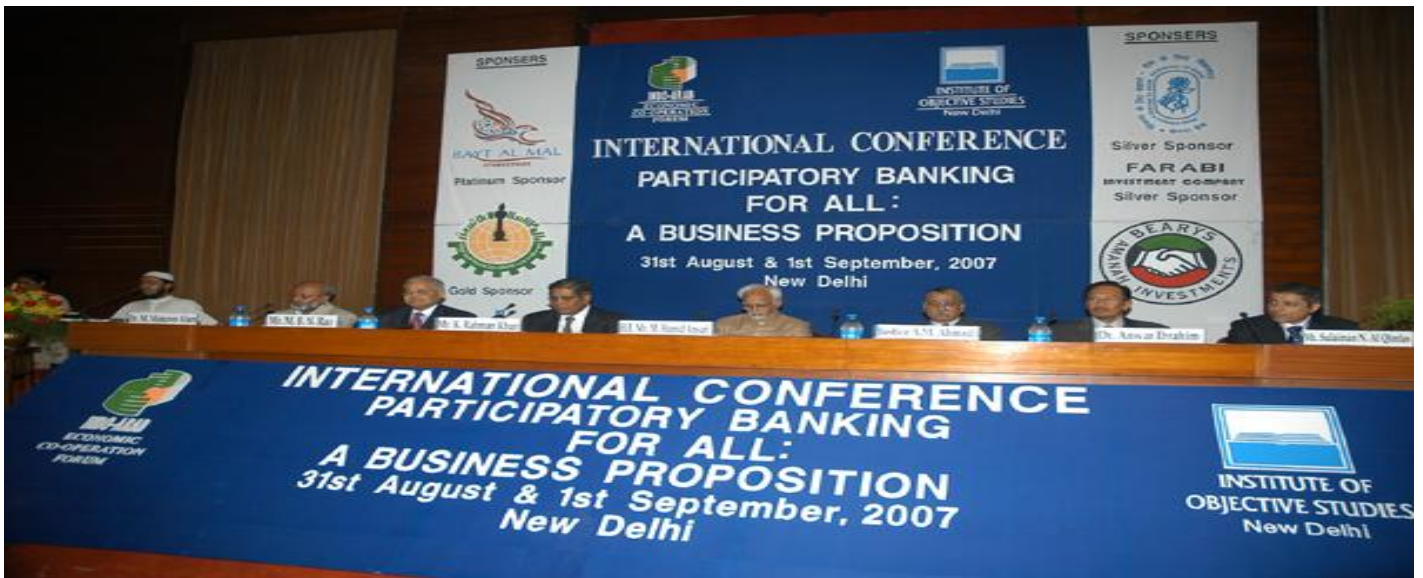
A view of Two-day International Conference on Participatory Banking for All: A Business Proposition at Parliament House Annexe, New Delhi on August 31 & September 1, 2007 Organised by Institute of Objective Studies and Indo-Arab Economic Co-operation Forum