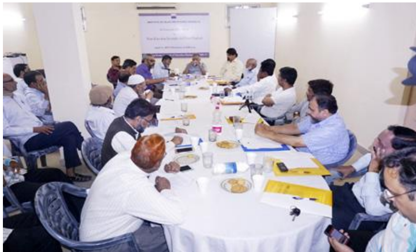
A view of the consultative meeting Post Election Scenario in Uttar Pradesh