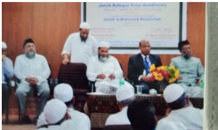
A view of the participants of the programme