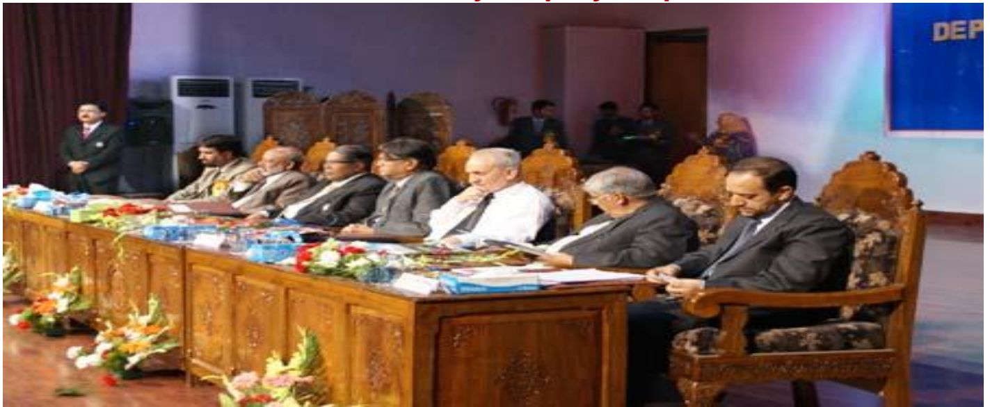
A view of Three-Day International Conference on "Interest-Free Institutional Mechanism (Banking, Finance and Insurance) for Promoting Investment" on June 3-5, 2011 at Kashmir University Organised by Institute of Objective Studies & Department of Business and Finance Studies, University of Kashmir