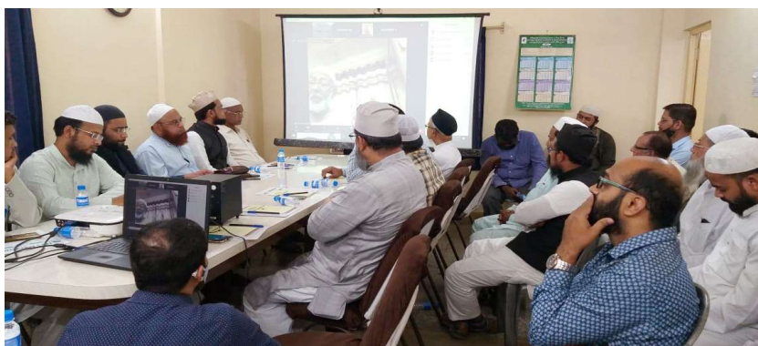
A view of the audience of the Symposium

Kolkata Chapter is organising a series of symposiums under the theme -“Remembering the 20th Century Islamic Scholars of West Bengal“. This symposium was the second in its series.