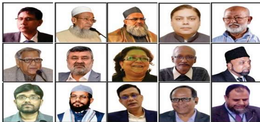
A view of the Speakers