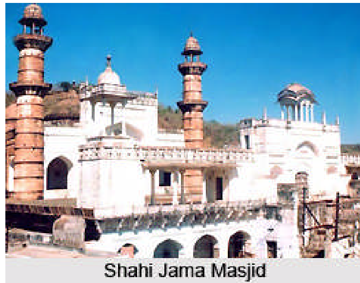
Shahi Jama Masjid

https://www.google.com/search?q=Date+of+Construction+of+Shahi+Masjid,+Baran,+Rajasthan&tbm=isch&source=iu&ictx=1&fir=2Eeff20kex9QAM%253A%252CVH5ArqAfMDuF9M%252C_&usg=__wO294Kctlwbqno9_DNXTrdLaHeM%3D&sa=X&ved=0ahUKEwj9r9PJvMvbAhXEu48KHS9gAeAQ9QEIQjAG#imgcr=Id-3t7uFCPQkGM:&spf=1528715700778