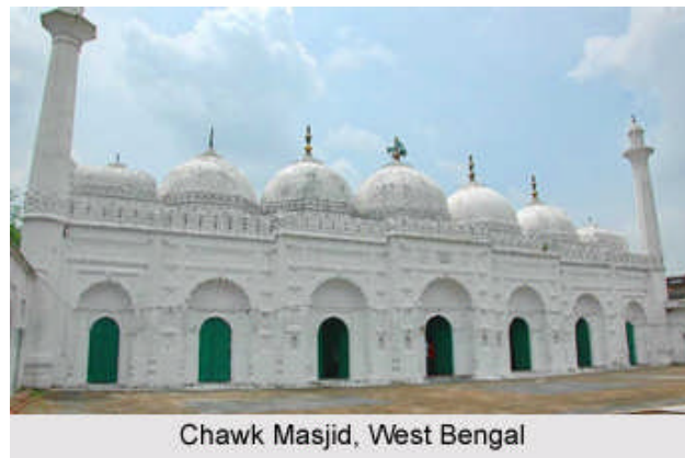
Chawk Masjid, West Bengal

The Chawk Mosque (also Chawk Masjid) is a mosque in the city of Murshidabad, India. It was founded in 1767 AD by Munny Begum, wife of Nawab Mir Zafar. Earlier in this place Nawab Murshid Quli Khan had built the " Chahel Sutan ", which was the city's forty pillared audience hall. The mosque still recalls the stories of the ruling days of the Nawabs and still holds on its glory of the past.