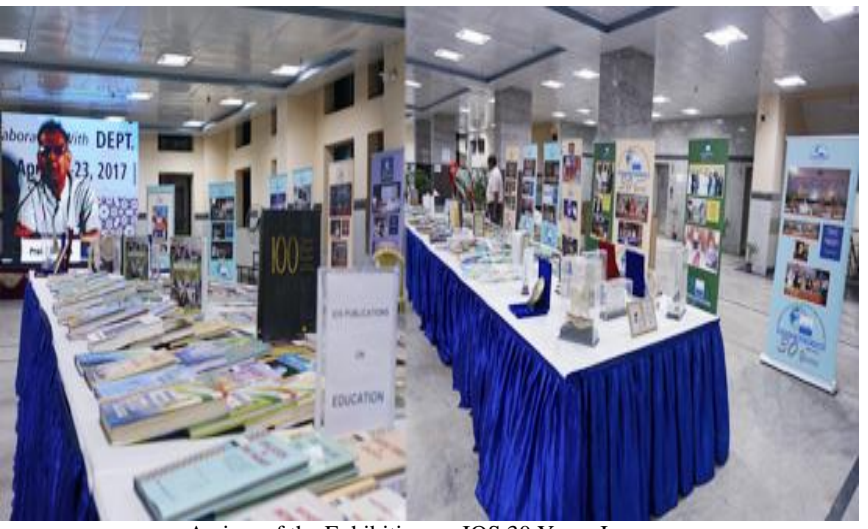
A view of the Exhibition on IOS 30 Years Journey