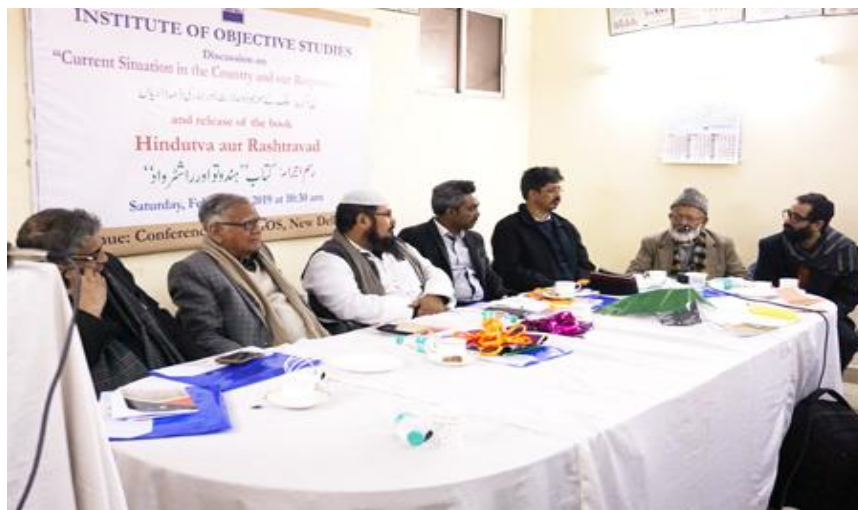
A view of the Discussion on Current Situation in the Country and Our Responsibilities