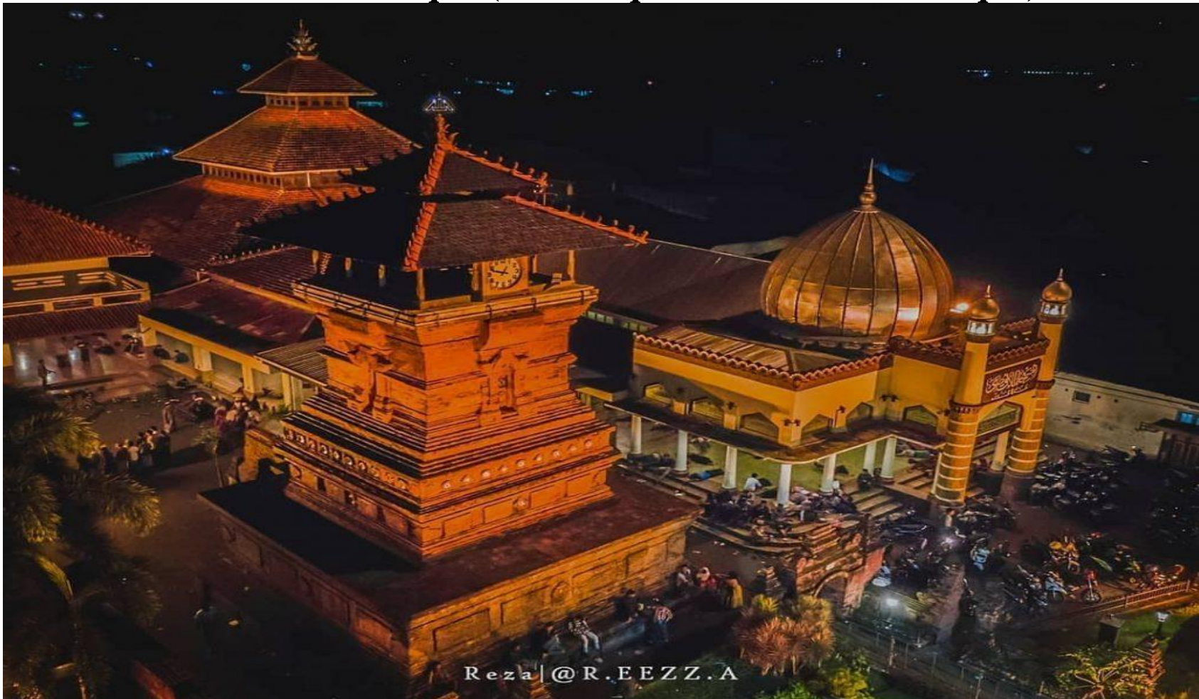
Menara Kudus.

This one has many names as people also refers to it as Al Aqsa or Al Manar Mosque. The most interesting part of this mosque is its watchtower. Instead of destroying the old Hindu tower, they use it as the new face of the mosque. This is part of the strategy to ease the implementation of Islam teachings. The mosque was built in 1549.