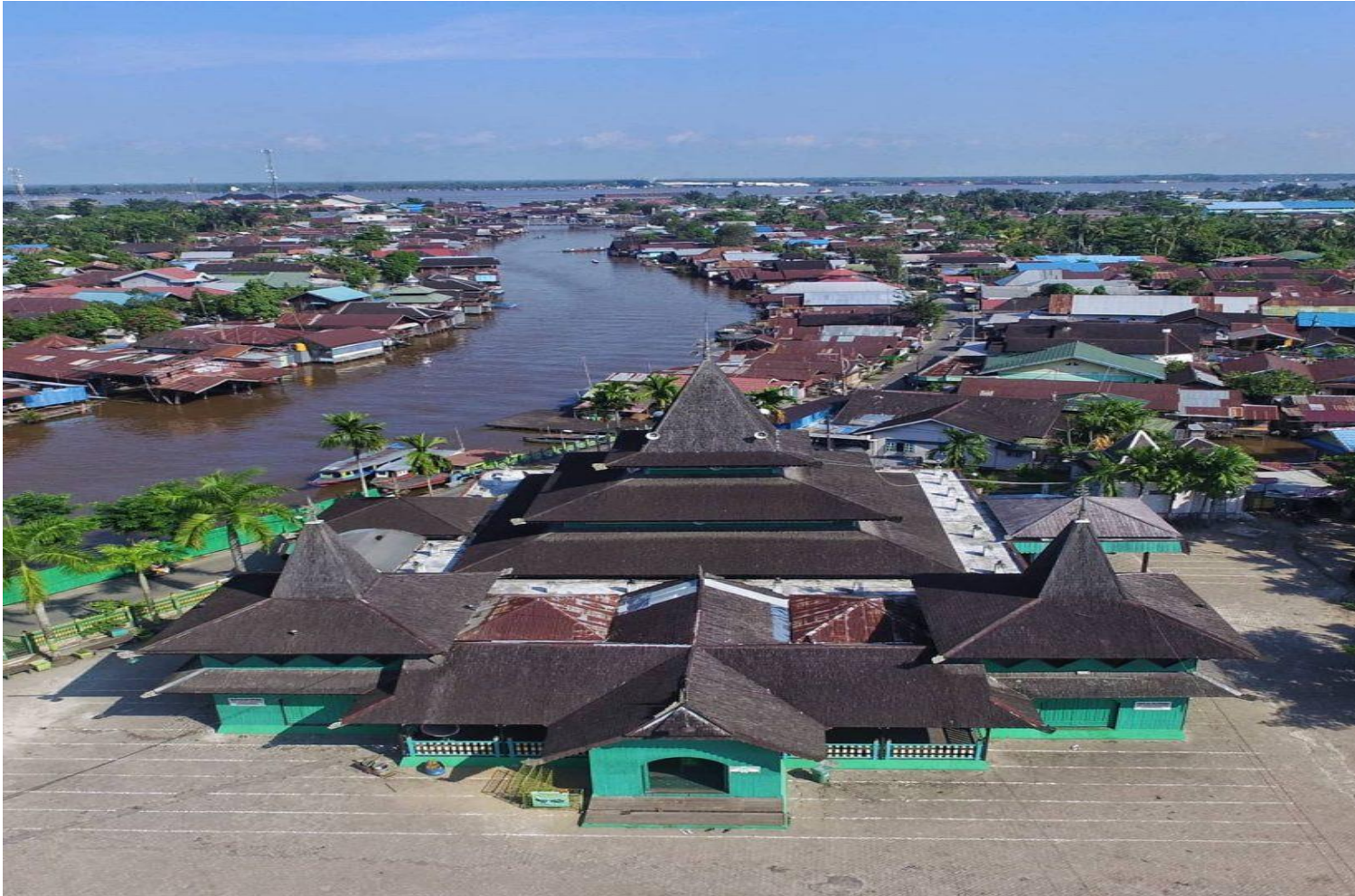
Sultan Suriansyah Mosque.

Often called Kuin Mosque, this mosque was built by the first Sultan of Banjar; Sultan Suriansyah on the side of a river. In a glance, this mosque looks more like a traditional Banjar house instead of worshipping place. This 500-year-old mosque still maintains its original traditional shape.