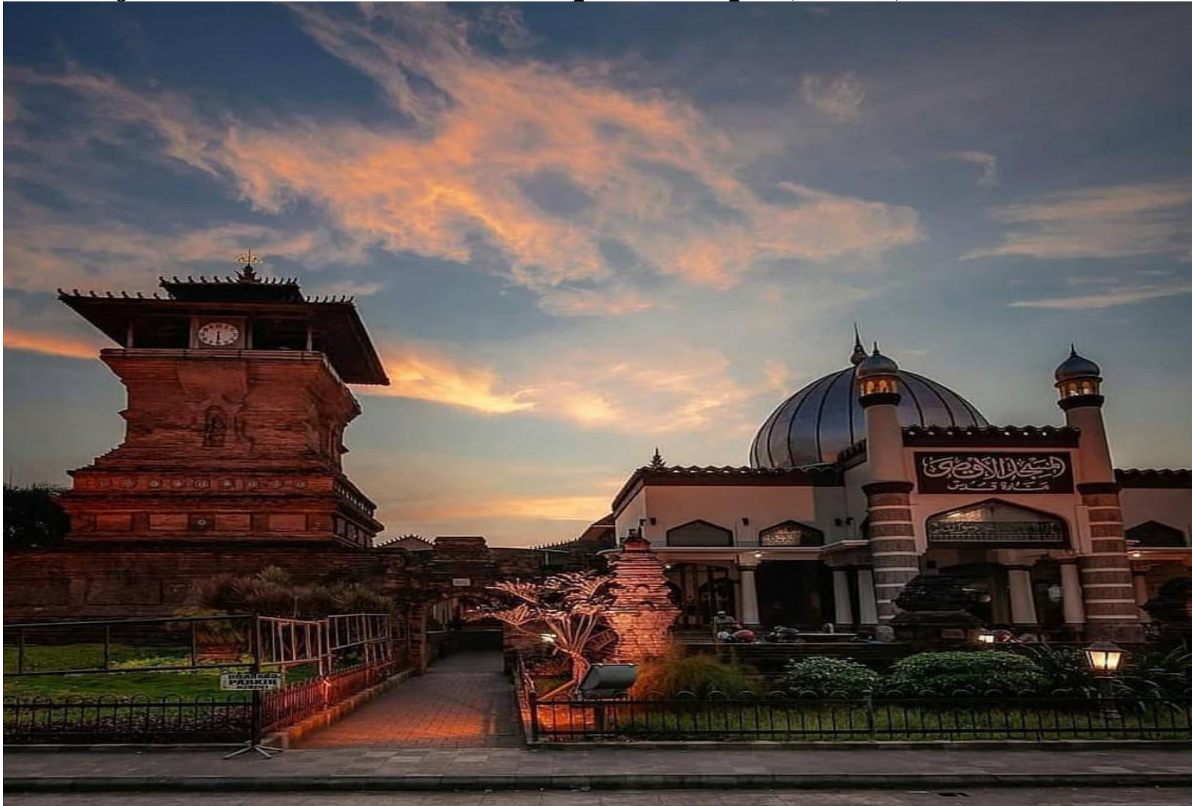
Menara Kudus. via Instagram/pratmrffy

Most of the first mosques in Indonesia originally uses local architecture shapes. Some have become milestones that connect the bygone era and the new one with Islamic teaching.