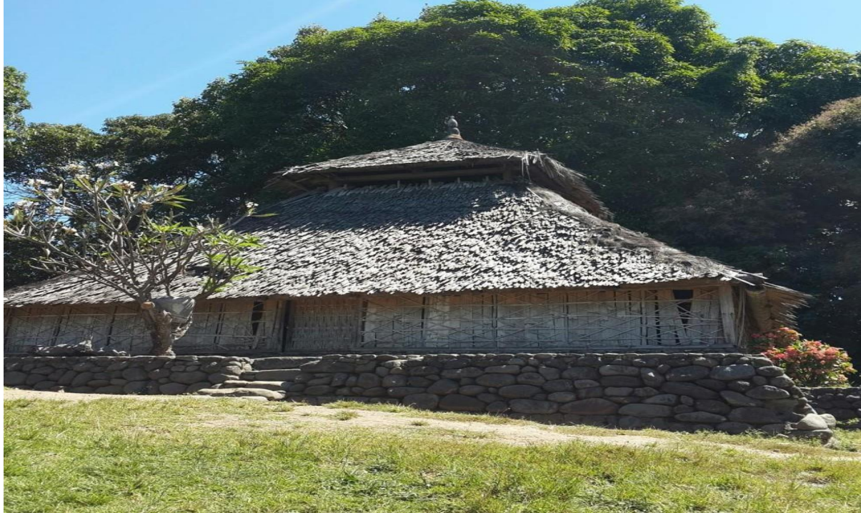
Bayan Beleq Mosque.

The oldest mosque in Lombok, Bayan Beleq is still in its original shape since 1634. Even though it has a very simple shape, the Bayan Beleq Mosque marks the beginning of the Islamic era in the Island of Lombok. Bayan area was the main gateway of Islam to this island.