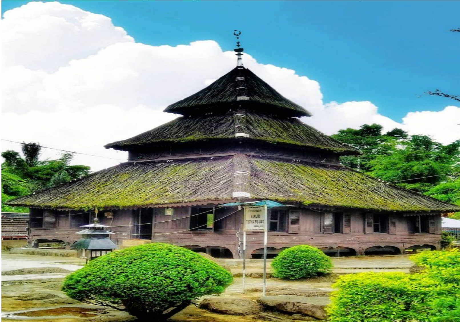
Masjid Tuo Kayu Jao.