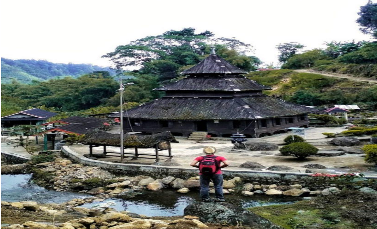
Tuo Kayu Jao Mosque.

When you look at this mosque, you might think that it's just another old Minang house. However, Tuo Kayu Jao Mosque is a functioning place of worship that has been standing since the late 16th century. Located at Jorong Kayu Jao, Nagari Batang Barus, Gunung Talang, Solok Regency, this mosque is now a protected historical building.