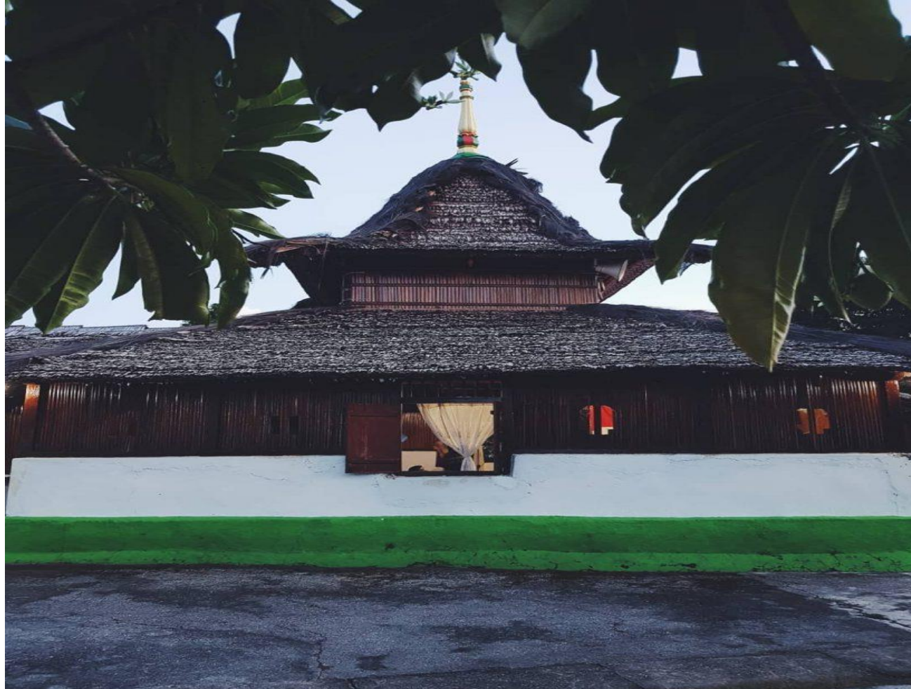
Wapauwe Mosque.

Standing on the northern shore of Maluku Island, Wapauwe Mosque has been in use since 1414. Several improvements have been made to the mosque, but it still has its original shape, including the grass roof. Wapauwe Mosque has several old handwritten Quran mushaf (copies), preaching scripts, and much more Islamic literature from the 16th and 17th centuries.