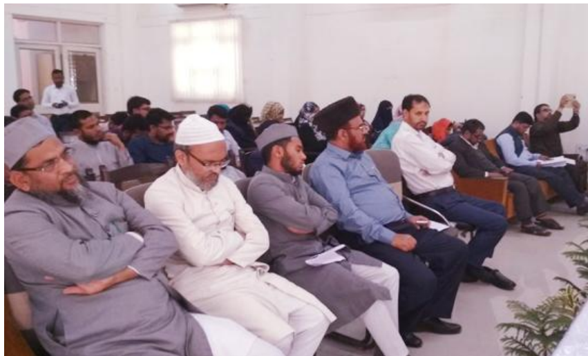
A view of the audience

Chapter 1, "Muslim Women in Popular Culture", gives an overview of the discourse around Muslim women. The chapter explores how Orientalism has influenced the presentation of Muslim women, particularly noting how Muslim women lose agency in all discussions. Arjana looks specifically at how the comic and cartoons have been subject to this thinking. She addresses how Muslims fall into the villain or the rescue narrative and then turns to the problematic representation of some Muslima superheroes. Comics are just the starting point, for such representations are found in cartoons and film as well. While this chapter provides a great basis for the rest of the book and an essential introduction to the narrative that has often surrounded Muslim women, it does at times jump quickly from one discussion to the next (as continues through much of the book).