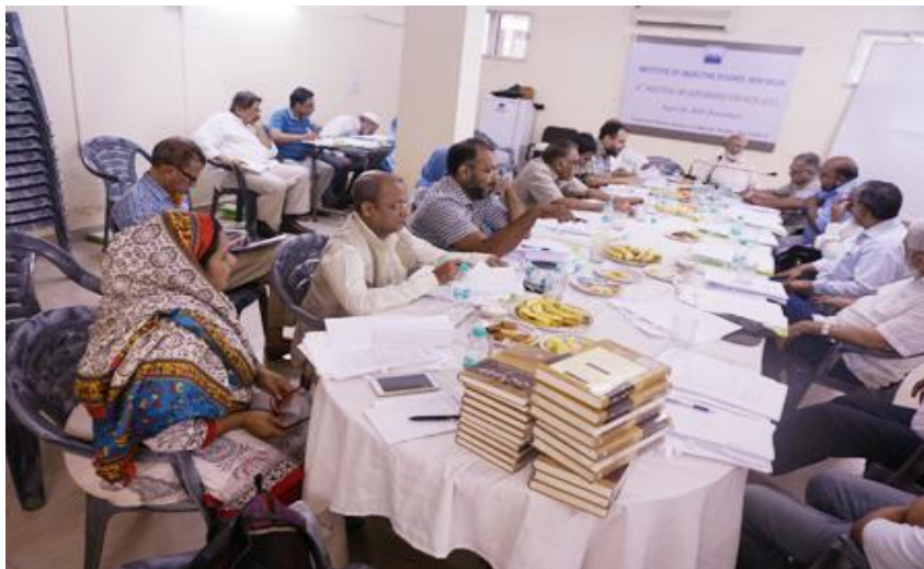
A view of the G.C. Meeting