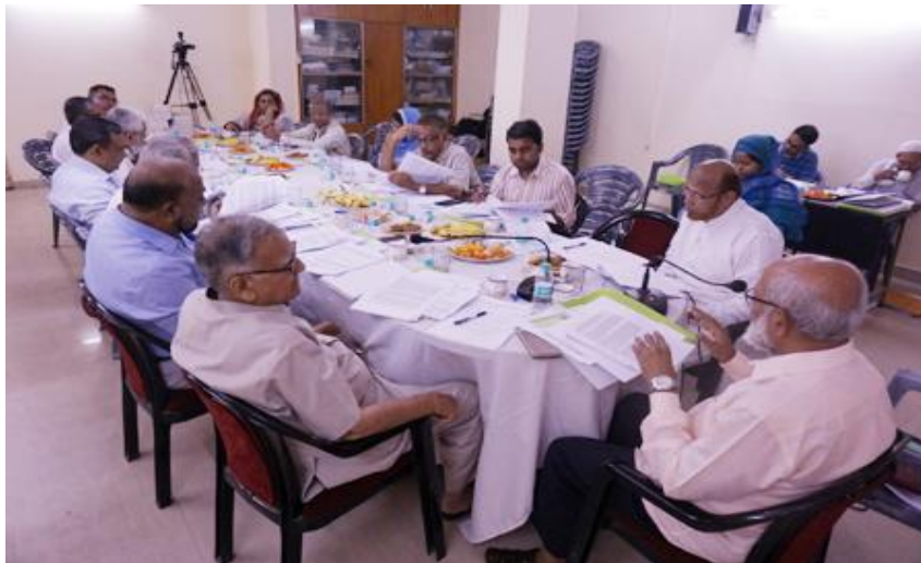
A view of the G.C. Meeting

Further, a Committee consisting of the following persons is constituted to