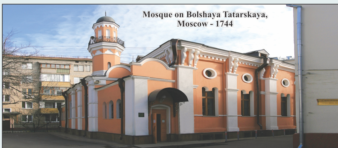
Mosque on Bolshaya Tatarskaya, Moscow - 1744