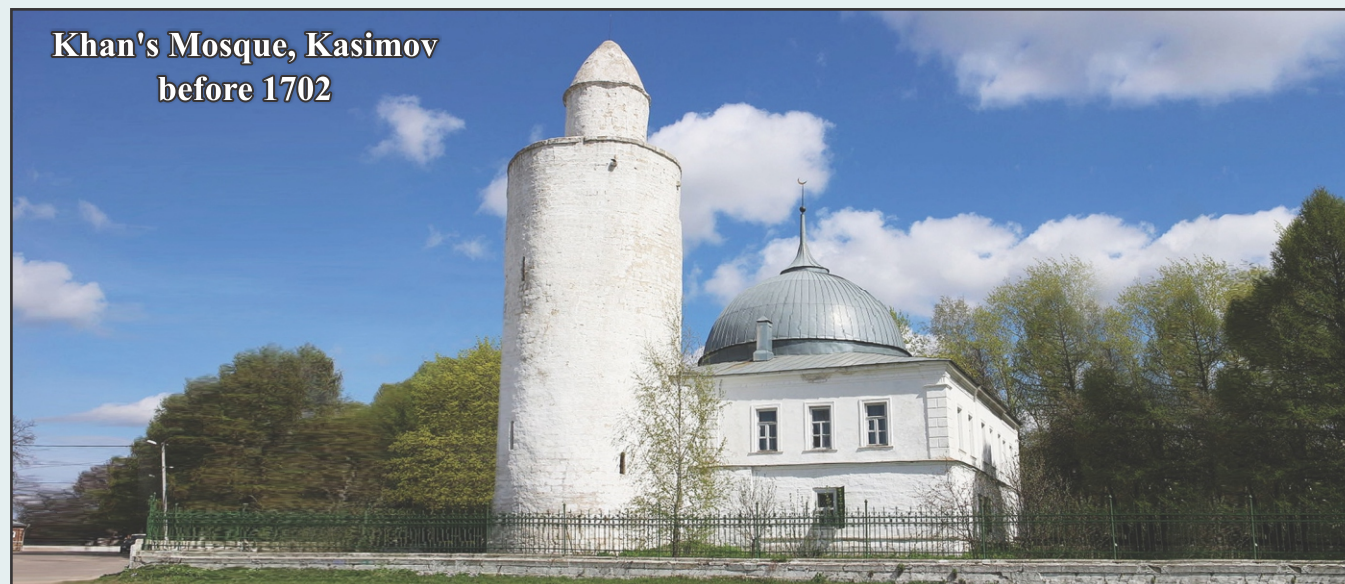
Khan's Mosque, Kasimov before 1702

In the ancient city of Derbent, in Dagestan, there is probably the oldest mosque in Russia, still in operation today – the Juma Mosque. It was built between 733 and 734. The mosque is also a UNESCO World Heritage Site. It was the emergence of the Juma mosque in Derbent that marked the spread of Islam throughout Dagestan. The mosque construction was initiated by Maslama ibn Abd al-Malik, an Arab general and the conqueror of Derbent. There was also other mosque in Derbent, but this one was the most important. Today, the mosque does not stand out against the background of modern, equally built of brick city constructions: it has no minarets; its dome is quite low – only 17 m high. But until the 19th century, the Juma Mosque was the largest building in Derbent, 67 m high and 17 m wide.