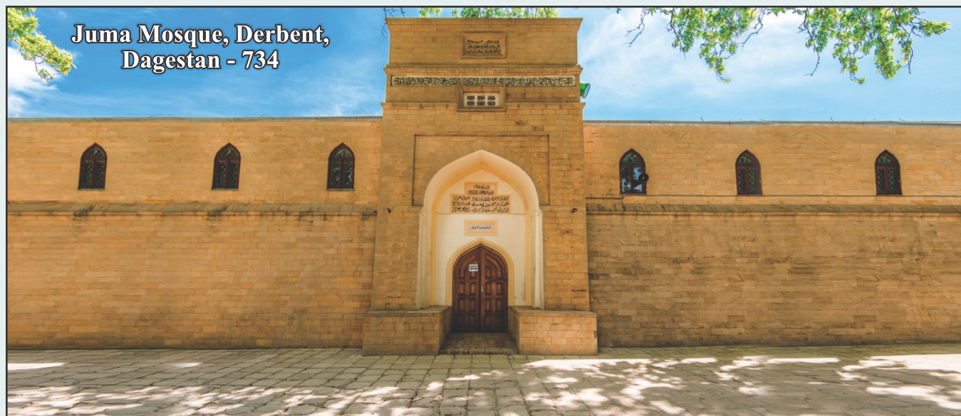
Juma Mosque, Derbent, Dagestan - 734

دنیا - مساجد تاریخ کے آئینے میں (آغاز ۲۰۱۱) - روس کی پانچ قدیم ترین مساجد العالم - المساجد في مرآة التاريخ (البداية من 2011 م) - خمسة أقدم مساجد في روسيا