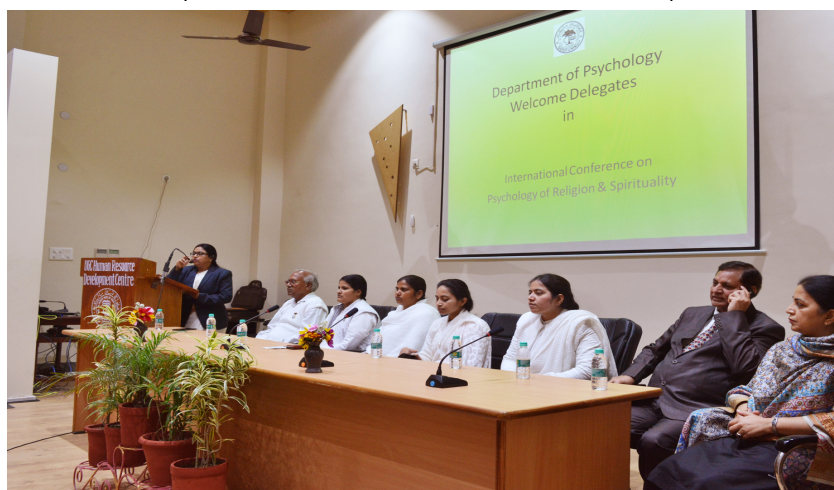
Speakers at Parallel Scientific Session-I