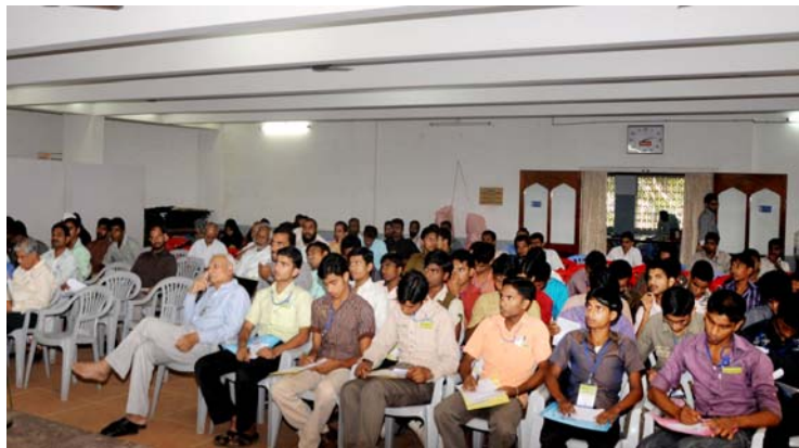
A view of audience