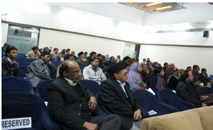
A view of audience

He said that once a colleague of his from the Indian Foreign Service asked him whether it was true that Islam offered non-Muslims a choice between