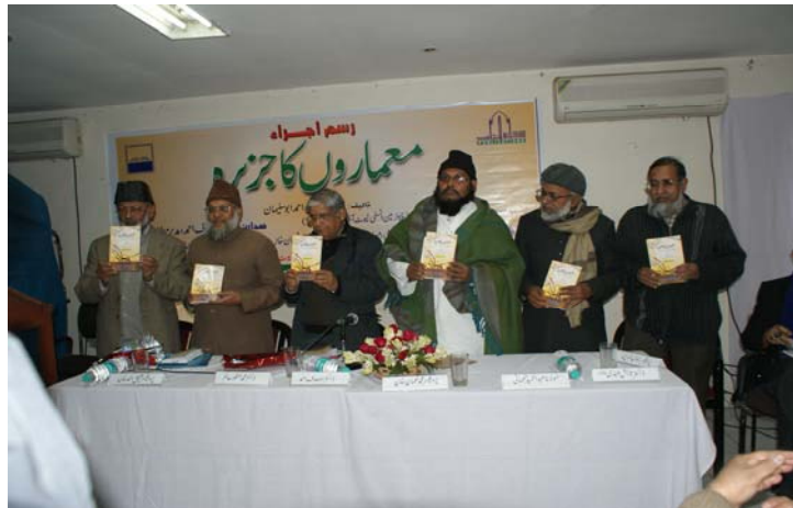
View of Book Release "Maimaron ka Jazeerah"